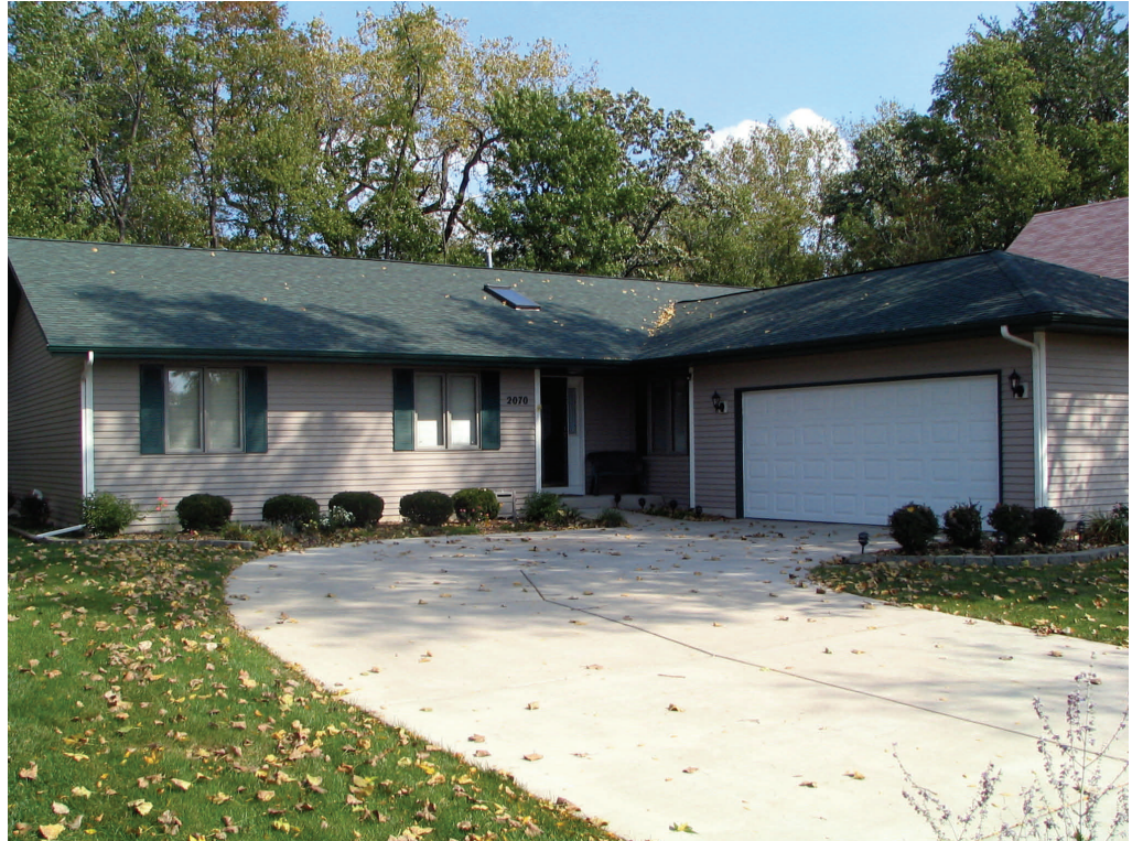
2070 Clearwater Way | Elgin | IL. | 60123